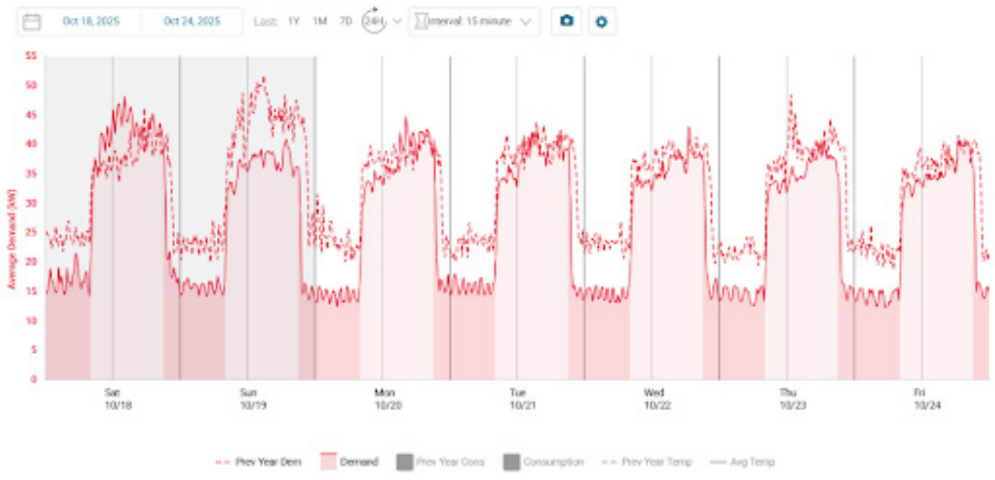
Figure 1. Comparison of Energy Usage from the Previous Year and the Period After Power TakeOff Intervention.

Since 2007, Power TakeOff has been an industry leader in data-first, virtual utility products and efficiency programs. Specializing in Energy Information Software, Power TakeOff transforms complex utility AMI data into personalized energy efficiency recommendations with proven measurement and verification results. Utilities across North America rely on Power TakeOff to enhance customer experiences, increase revenue, meet efficiency goals, and reduce greenhouse gas emissions. Learn more at www.PowerTakeOff.com .